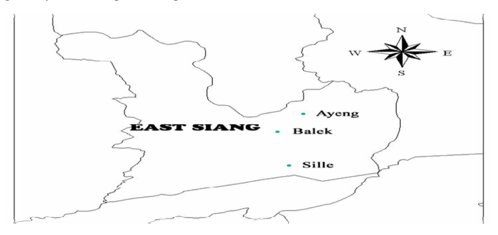
Fig. 1. Site of study, East Siang district, Arunachal Pradesh, India.

site represents a subtropical, hot and humid climate; in the lower valleys, summer temperatures in June, July and August typically rise to about 30°C, while winter temperatures in December, January and February usually drops to 13°C. Annual rainfall in the state averages 3,300 mm, falling mostly between April and September in the centre of the state.